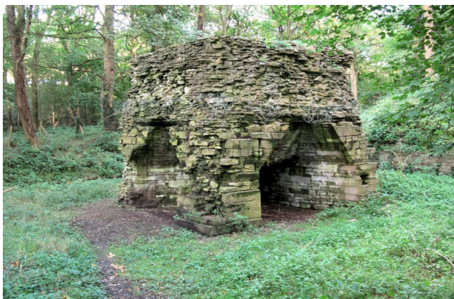
Rockley blast furnace, Barnsley

For Saturday morning, I have arranged a guided tour around Wortley Top Forge - an industrial museum set in the oldest surviving water-powered heavy iron forge in the world. It was famous for its wrought iron railway axles and boasts two water powered helve hammers, as well as a bar mill, and a wide selection of engines and tools.