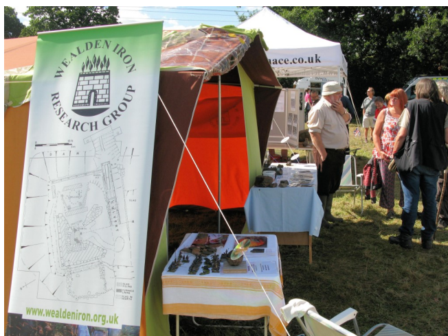
Setting out our stall at Fernhurst

Two weeks later, on 3-4 September, we were in East Sussex at the Pippingford ‘Into the Trees’ event. On arriving