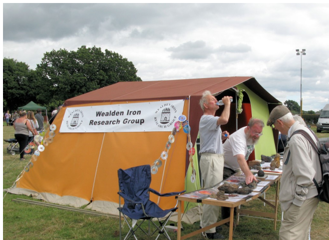
Thirsty work, all that talking

During the summer, WIRG took the newly created information boards and a display of various iron related artefacts – ore; slag; bloomery iron, a proofing cannon ball, photographs – and even Simon’s model cannon and Victor’s clay base of a reproduction bloomery furnace - to three events covering east, central and the west of the Weald.